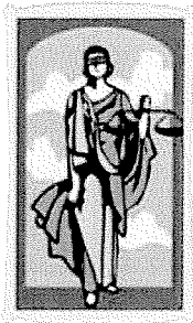
State Bar Association of North Dakota