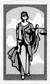
State Bar Association of North Dakota